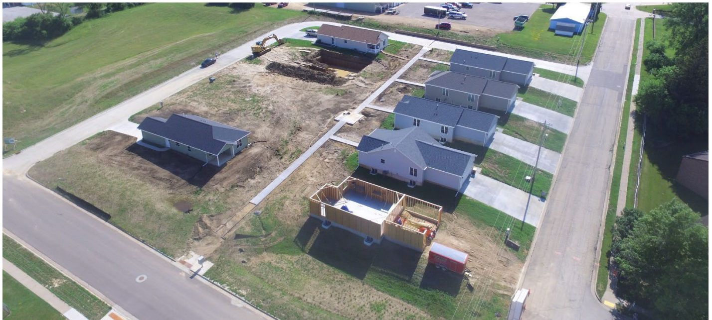
New Homeownership Development (Bear River Cottages - Maquoketa, IA)